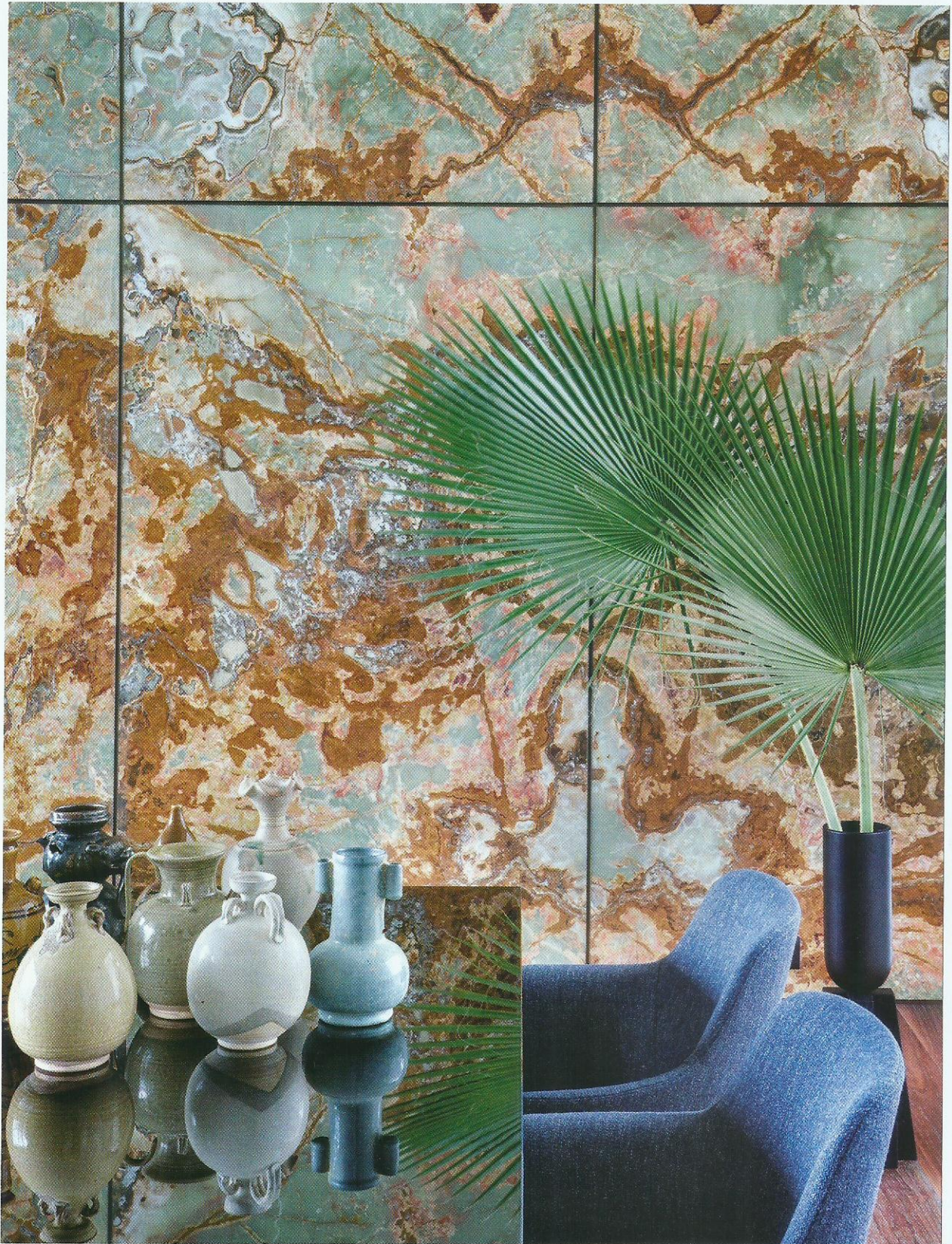
A collection of antique Chinese pots are seen on the bespoke, black glass dining table, which is paired with Chelsea chairs by Molteni&C. Onyx lines an entire wall in the room FACING PAGE The checkered screens of the facade cast shadows on the timber panelling, while a painting by Abir Karmakar is mounted on the wall at the far end